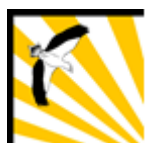
GIBBS: Mind and Vision

Coomera Anglican College operates a four House structure from Prep to Year 12. The four houses are: