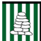
SMITH: Heart and Determination